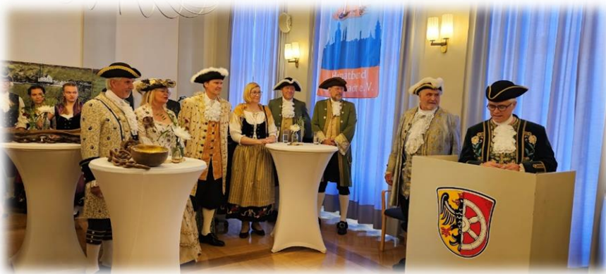
Reception at the Town Hall for the 3 candidates for the Spoon Competition