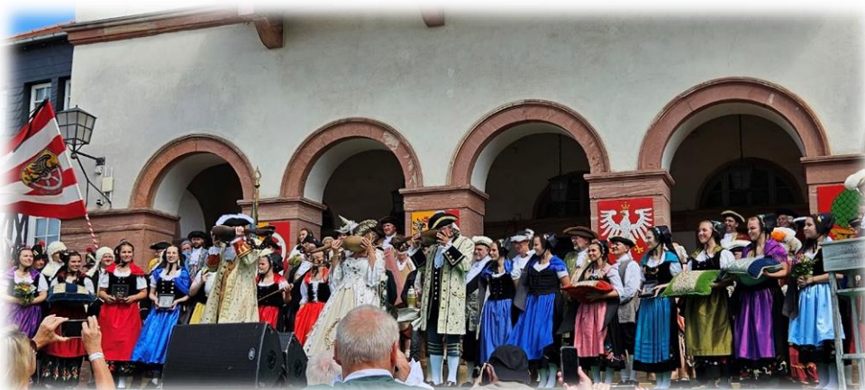
The Drinking from the Spoon Competition – it's a VERY LARGE Spoon!